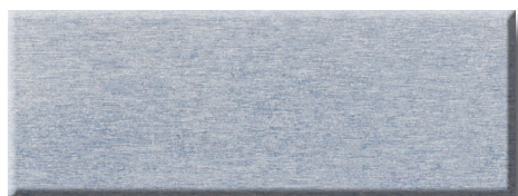
BRITE BRUSHED CLEAR