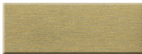
BRITE BRUSHED GOLD