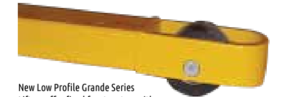
New Low Profile Grande Series Lifters offer fixed front casters with lower clearance in the front forks.