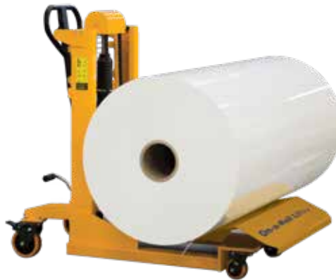
Model 61590 GRANDE Best for converters and package printers.