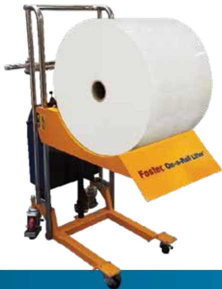
Model 61576 NARROW WEB Motorized lifter best for label printers and converters.