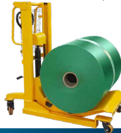
Model 61593 GRANDE APEX Best for roll diameters up to 39”.