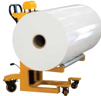
Model 61592 SPINNER Positions media rolls for converting, winding, and unwinding.