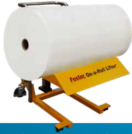
Model 61596 STANDARD GRANDE Best for lifting, transporting and unloading large diameter rolls.