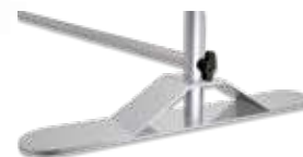
Sturdy Steel "Bridge" Support Base.

Note: For heavy weight vinyls & graphics, special order uprights with B locks. Extra cost applies.