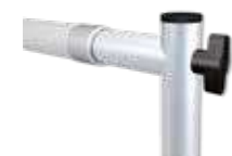
Twist lock offers infinite horizontal and vertical adjustments.